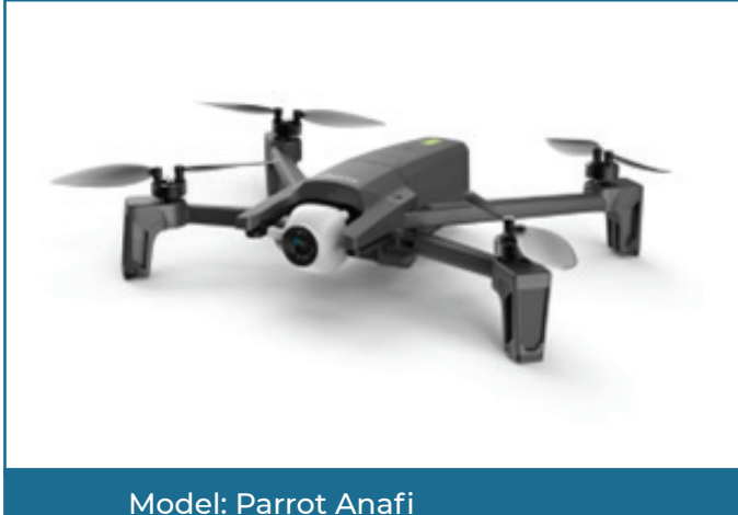
Model: Parrot Anafı Colour: Black Unfolded size: 175x240x65mm Weight: 320g

For the HyNet Spur Pipeline proposed developments aerial surveys, we will use these drones: